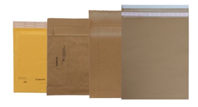
Shown: Cushioned, non-cushioned and rigid paper protective mailers

Our portfolio of paper mailers have been recognized by shipping professionals as the standard of excellence for quality in protective mailers for over 50 years. Our vast assortment of mailers are available with varying degrees of durability and sustainable benefits to fit your unique application needs. Produced according to world-class standards, these products represent the most complete line of cushioned, non-cushioned and rigid protective mailers.