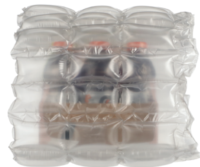
Shown: Extreme Grade High-Performance Inflatable Cushioning (Quilted) wrapped around sport drinks

Our vast portfolio of BUBBLE WRAP® brand high-performance inflatable cushioning offers damage protection varying from light to heavy. These high-performance inflatable cushioning solutions are available in a variety of bubble heights and material grades, including anti-static, allowing for a more optimal level of protection for each individual application. With high abuse resistance and long air retention, these on-demand inflatable solutions provide superior protection from vibration and shock, making it the ideal solution to reduce damage while in transit. Delivering consistent performance and eliminating excessive product over-wrapping, these inflatable cushioning solutions offer an improved experience for you and your customers.