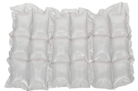
Extreme Grade High-Performance Inflatable Cushioning (Quilted) - Inflated