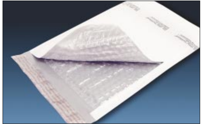
Tough, coextruded film/Bubble Wrap® material lamination and strong hot-melt closure provide the best protection and security.