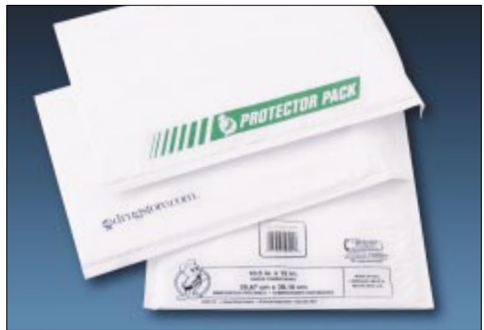
Fine texture surface is excellent for custom graphics.