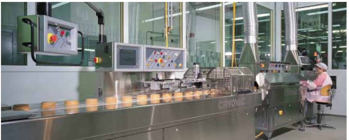
Cryovac CJ55 system