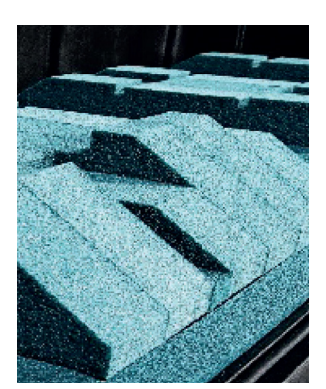
FR AND FRAS ETHAFOAM

Designed to specifically address the less than 10% LEL (Lower Explosion Limit) of residual blowing agents required for enclosed military applications.