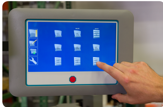
Industrial Grade Touch Screen Display