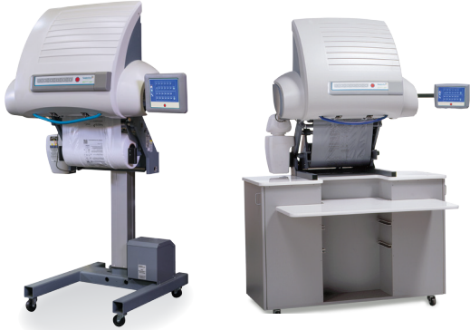
19-INCH FLOOR MODEL