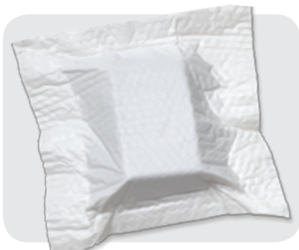
PriorityWrap® Bubble Laminate