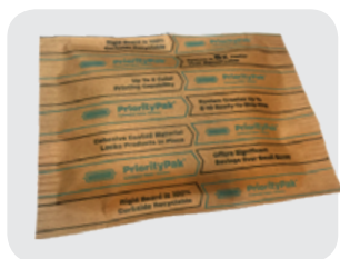
PriorityWrap® Rigid Board